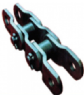
OFFSET SIDE BAR CHAIN FOR CONSTRUCTION EQUIPMENT