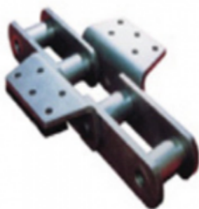
BUCKET ELEVATOR CHAIN FOR CEMENT PLANT