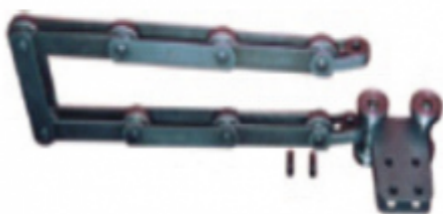
VERTI CHAIN WITH BI-PLANAR ATTACHMENT AND TROLLEY